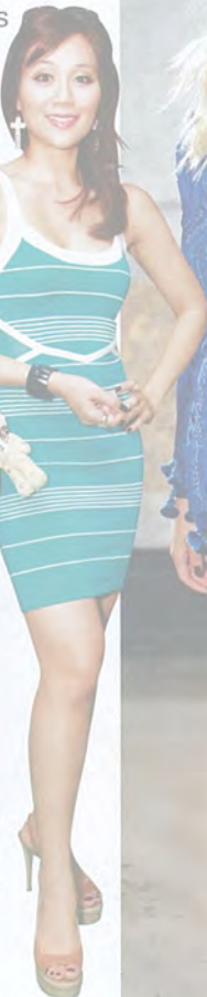
Elna Koh in a bandage dress she bought in LA.