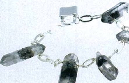
Grit Chain Gang sterling silver bracelet, $398, from Carrie K.

At the Buddy Vs The Killer charity gala for the Viva Foundation for Children with Cancer, guests chose black dresses accented with dramatic accessories.