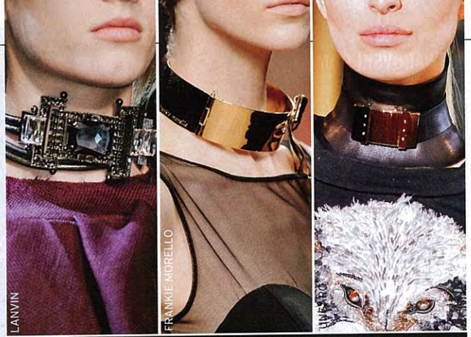
NECK TO NECK: The Fall/Winter runways favoured oversized jewellery, particularly the chunky choker — from sci-fi-meets-cocktail to fetish-chic, stick your neck out!